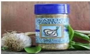
Garli Gami All Purpose Garlic Seasoning (Small)