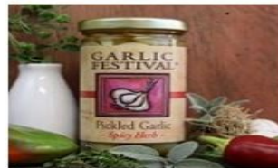
Spicy Herb Pickled Garlic (8 oz.)